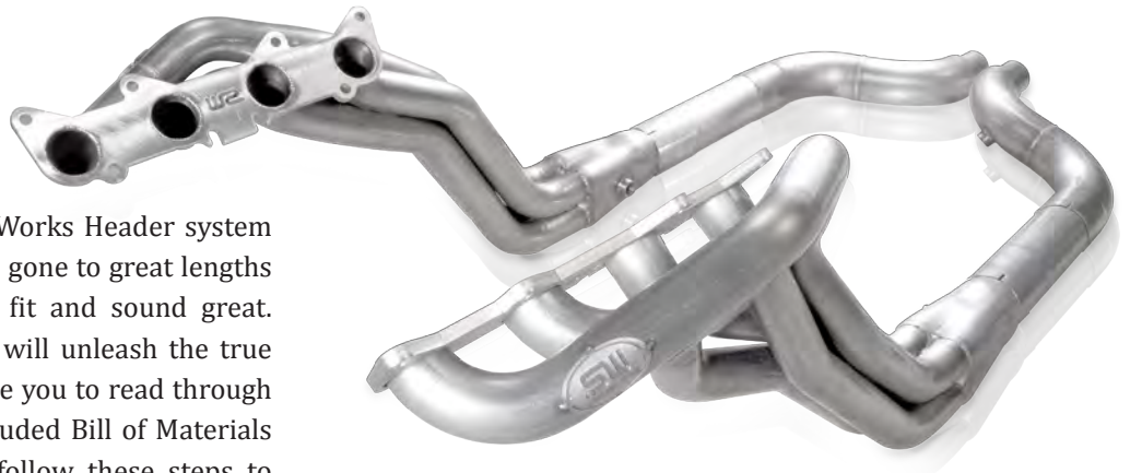
Shelby GT350 Headers

Thank you for purchasing a Stainless Works Header system for your 2015+ Shelby GT350. We have gone to great lengths to be sure that our exhaust systems fit and sound great. We are proud to say that this system will unleash the true character of your vehicle. We encourage you to read through the following steps, and check the included Bill of Materials before beginning installation. Please follow these steps to ensure that your installation goes as planned.