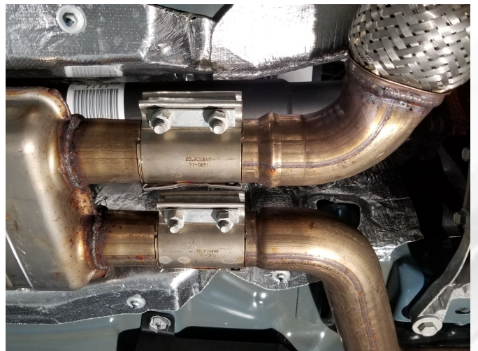
Detail 20: OEM catback connections