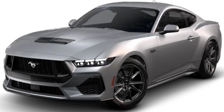
2024 FORD MUSTANG GT 5.0L

Thanks for purchasing a Stainless Works Header system for your 2024 Ford Mustang 5.0L. Our team has worked to ensure that this product is the premium in performance, quality, and fitment. We are proud to say that this system will unleash the true character of your vehicle. We encourage you to read through the following steps, and check the included Bill of Materials before beginning. Please follow these steps to ensure that your installation goes as planned.