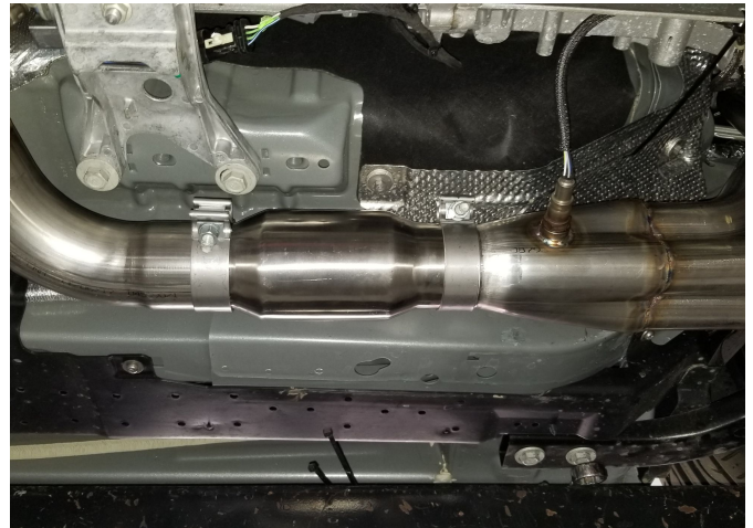
Detail 28: Lead pipes and O 2 's installed

After double checking for clearance and making sure all lines, wires and hoses are secured, drive the car for 10-20 miles and re-check all clamps and clearances. Your system may be tack welded at the joints/ clamps to reduce shifting of the system during heating and cooling cycles. Make certain to disconnect the battery before performing any welding.