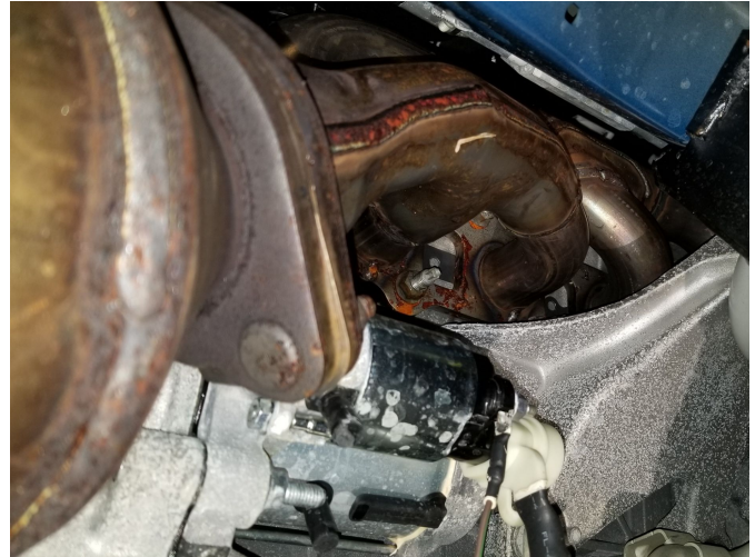
Detail 18: OEM manifold