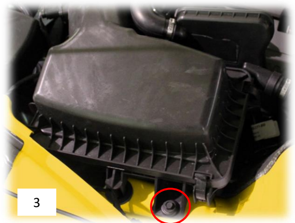
Figure 3: Factory air box