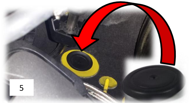
Figure 5: Sound tube plug installed