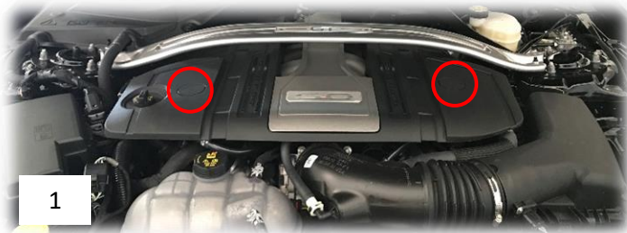
Figure 1: Factory engine bay