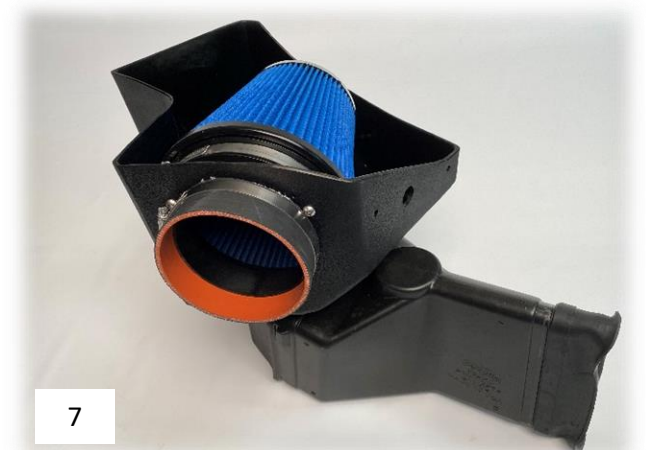
Figure 7: Steeda airbox assembly