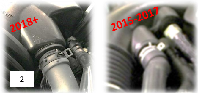
Figure 2: Hoses connected to factory intake tube