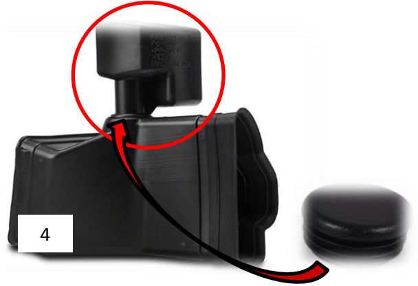
Figure 4: Factory resonator on inlet duct and Steeda plug