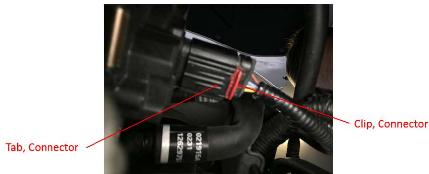
Figure 2. ECM Connector viewed from underside.